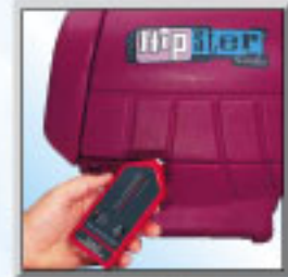
Low Noise The quietest industrial quality vacuum in its class.