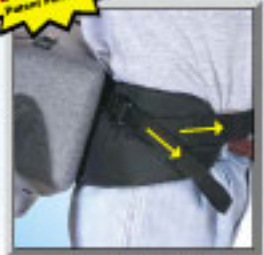
Four Way Belt Tensioner ensures maximum adjustability and comfort.