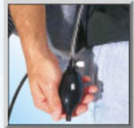
*Inflatable Lumbar Comfort just doesn't get any better than this! (Pop-out)