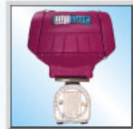
Light Weight It's power to weight ratio is incredible!