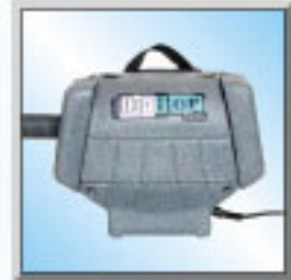
Reversible Cap An easy adjustment for left or right handed use.