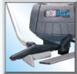
Industrial Size 1 1/2" Tool Kit Better air flow and less clogged hoses.